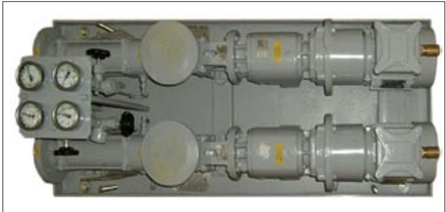
Allweiler Navy Excentric Screw Pump Skid

Colfax Navy has the global presence it needs to provide highly qualified expert advice as well as rapid and reliable support anywhere in the world. The Colfax Navy team works closely with every customer throughout the design, manufacturing, and delivery phases and keeps them up-to-date with technical data and documentation. Customers have secure online access to 2D and 3D drawings to facilitate integration into pipework layout design.