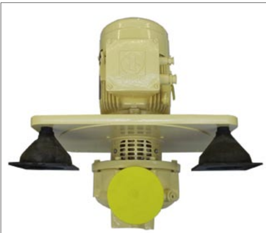
Allweiler Inline Centrifugal Cooling Water Pump